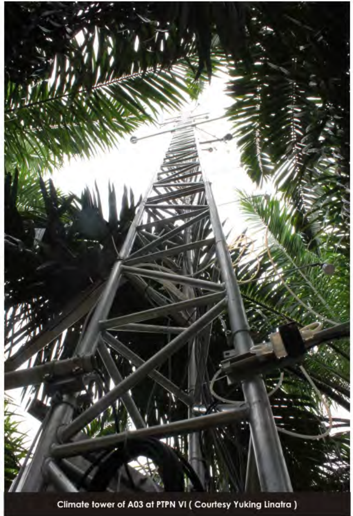
Climate tower of A03 at PTPN VI