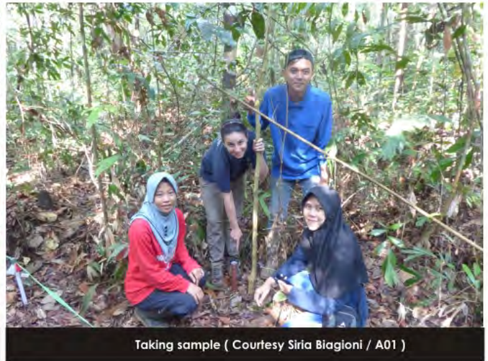
Taking sample