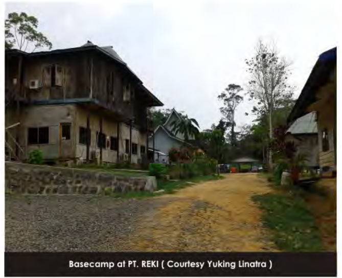
Basecamp at PT. REKI