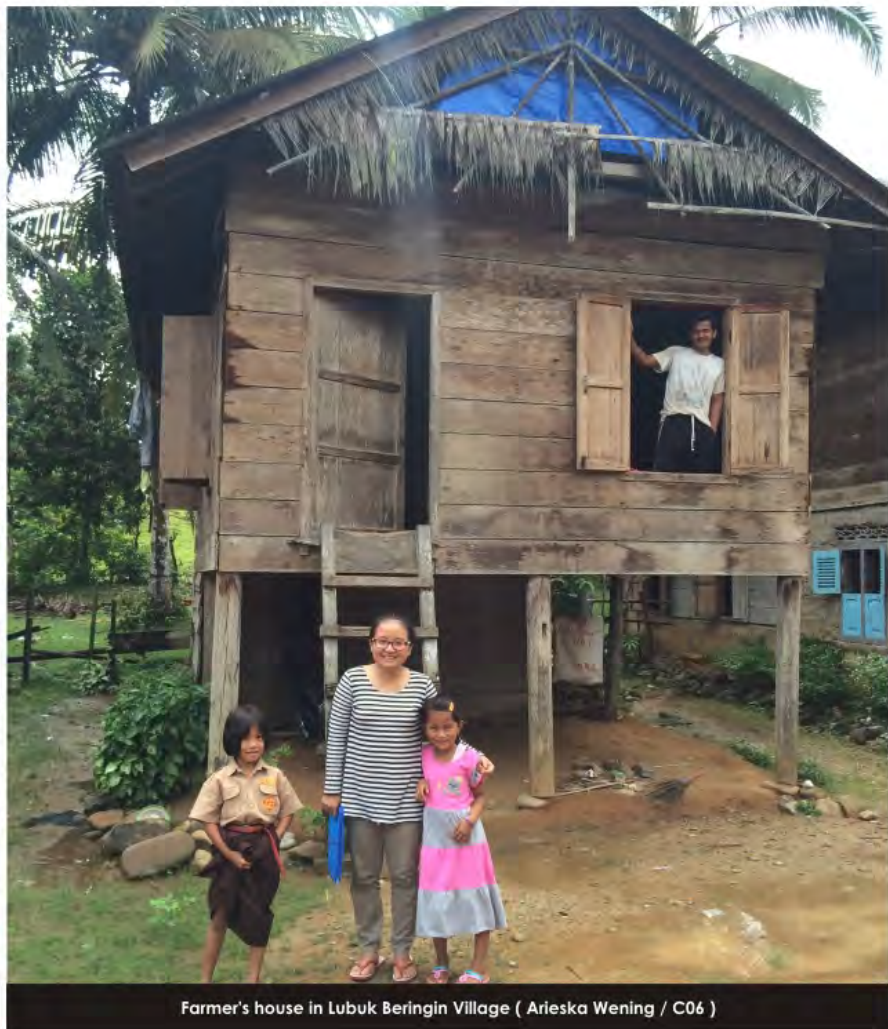
Farmer's house in Lubuk Beringin Village