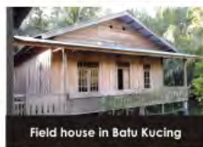
Field house in Batu Kucing