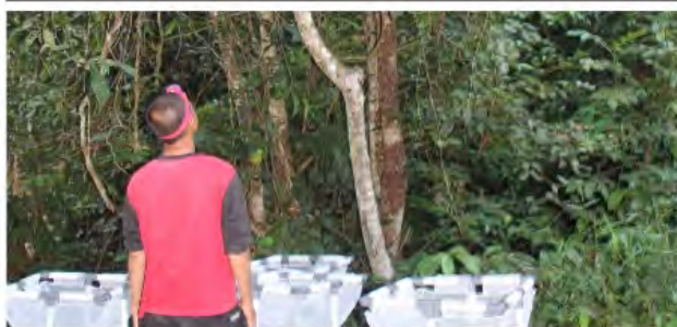
Collecting sample