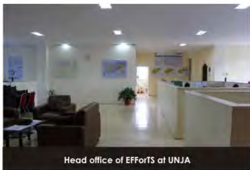
Head office of EFForTS at UNJA