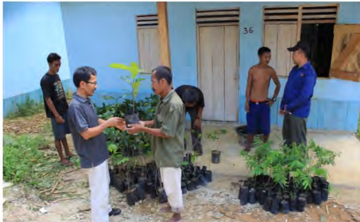
The delivery of fruit seedlings to suku anak dalam in March 2014