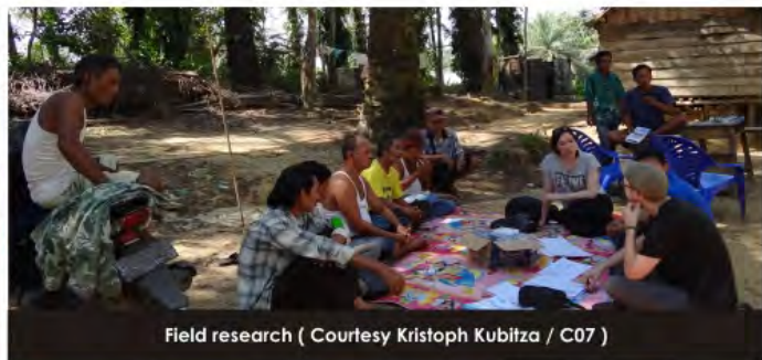
Field research