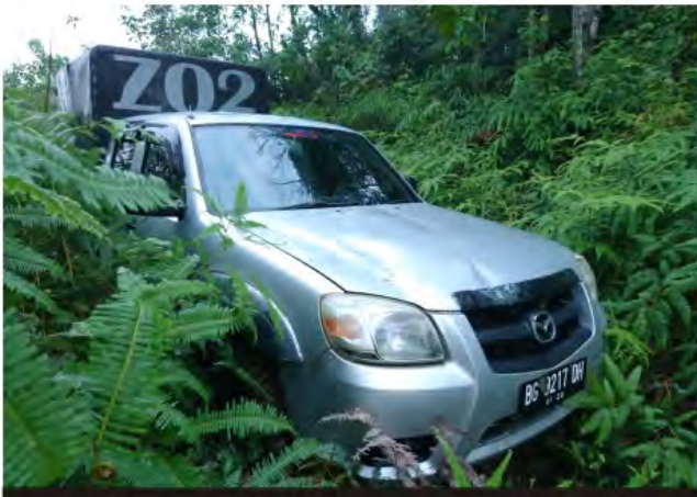
Car going into the forest