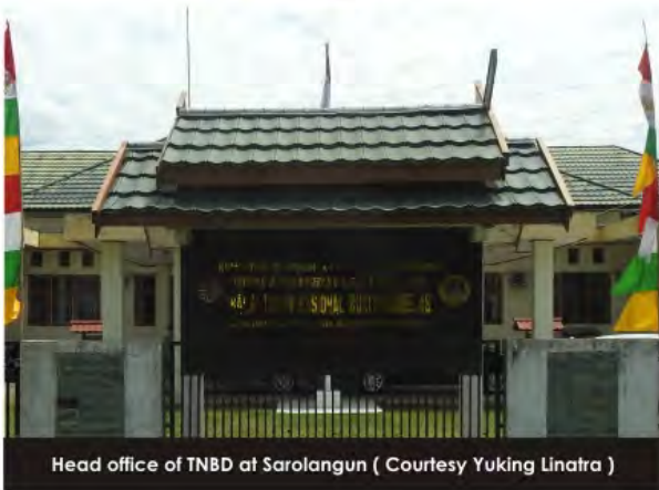
Head office of TNBD at Sarolangun