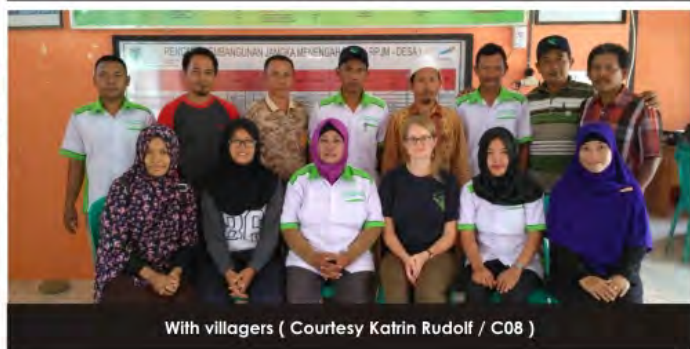
With villagers