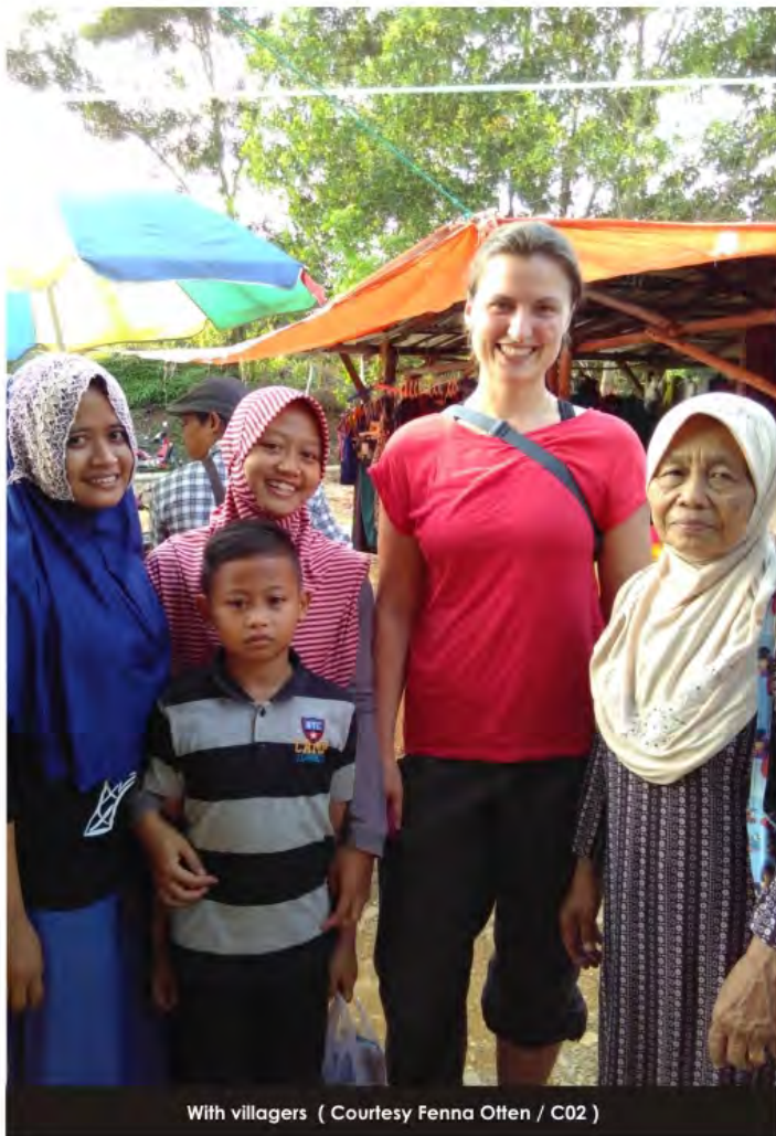
With villagers