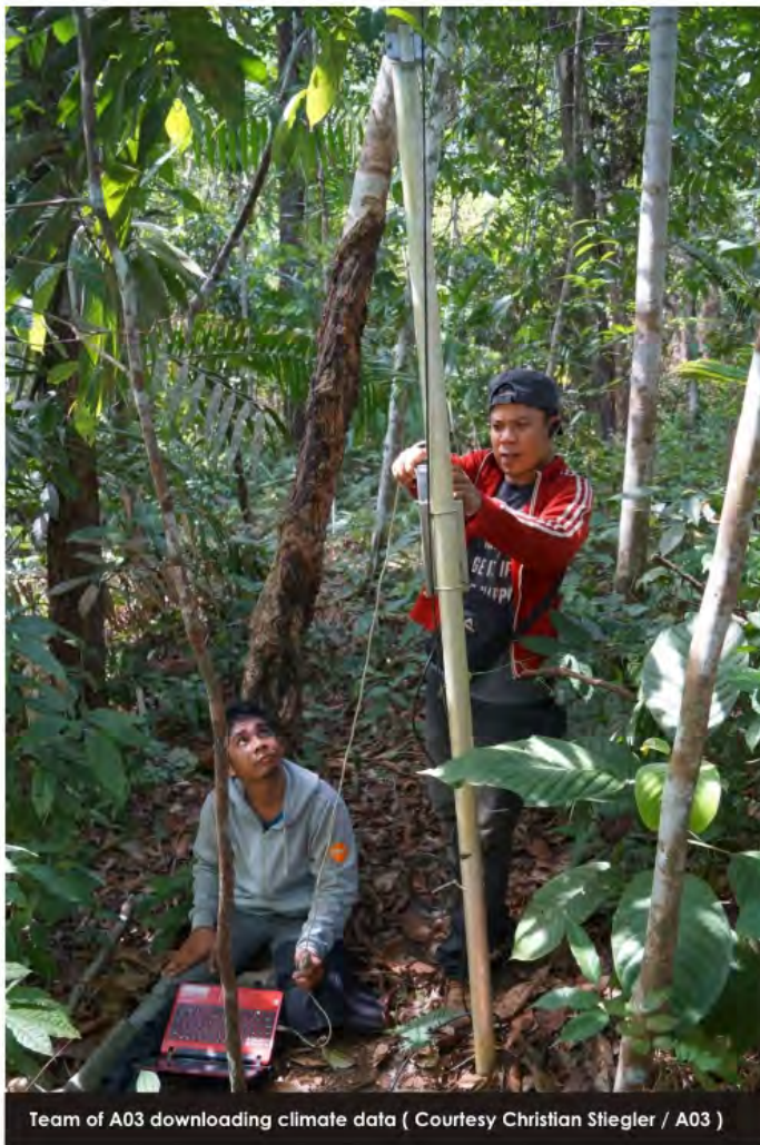
Team of A03 downloading climate data