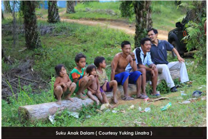
Suku Anak Dalam