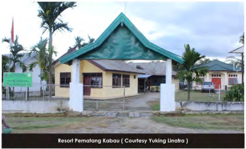
Resort Pematang Kabau