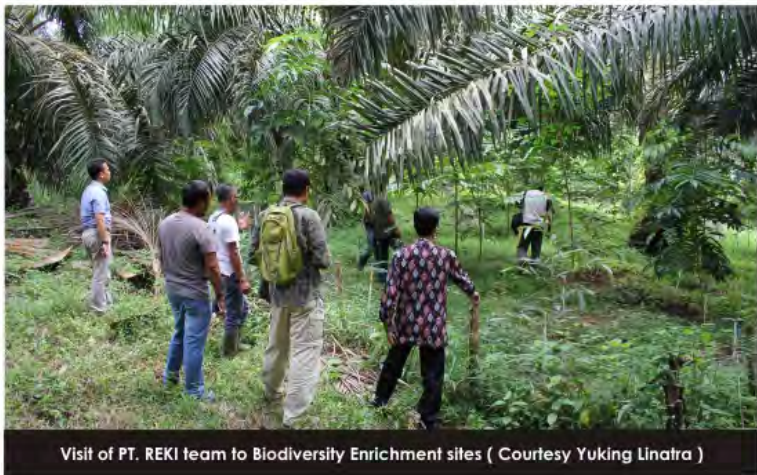
Visit of PT. REKI team to Biodiversity Enrichment sites