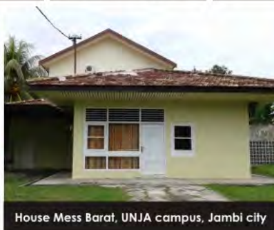
House Mess Barat, UNJA campus, Jambi city