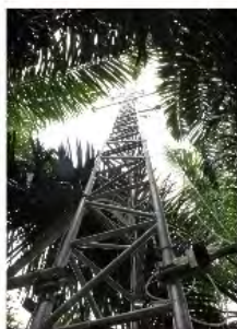
Climate tower of A03 at PTPN VI