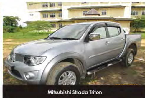
Mitsubishi Strada Triton