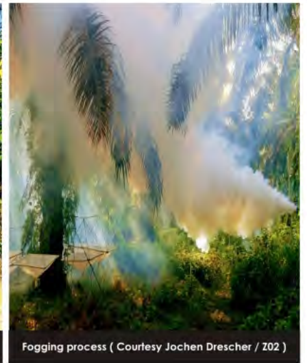
Fogging process