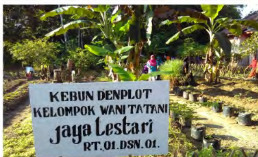
Villagers demoplot