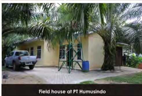
Field house at PT Humusindo