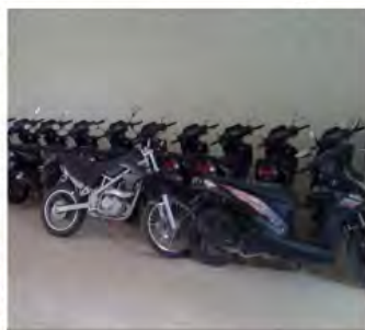
Motorbikes for field work