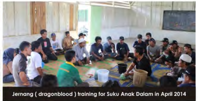
Jernang ( dragonblood ) training for Suku Anak Dalam in April 2014