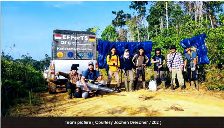
Team picture