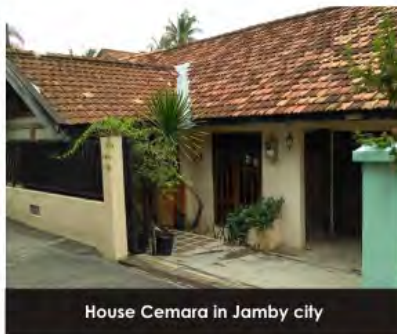
House Cemara in Jambi city