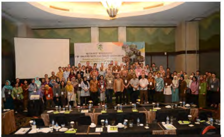
Kick off workshop in May 2016