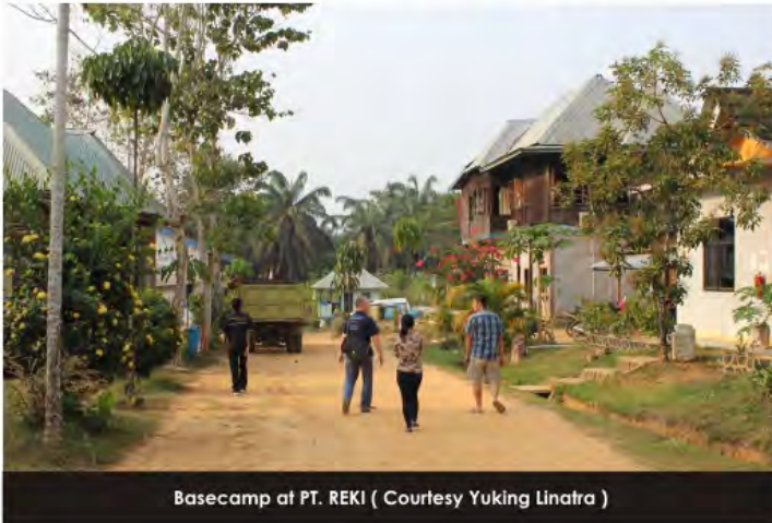
Basecamp at PT. REKI ( Courtesy Yuking Linatra )