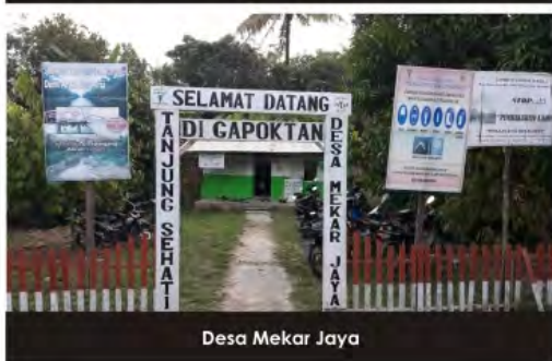
Desa Mekar Jaya