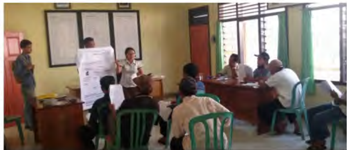
Dilemma experiment in Giriwinangun village