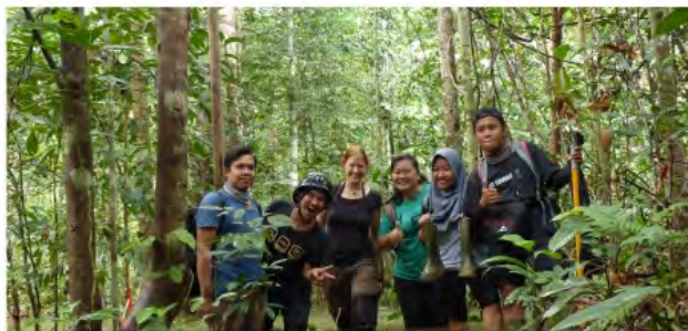
Field activities