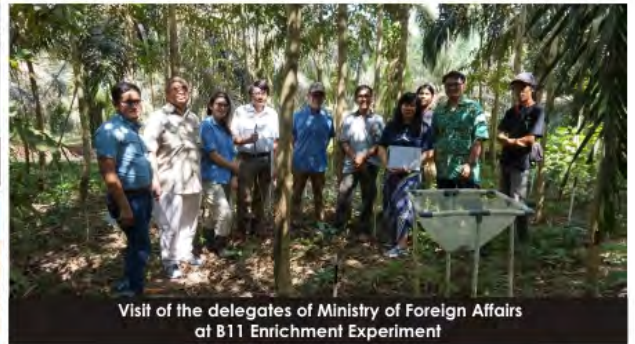
Visit of the delegates of Ministry of Foreign Affairs at B11 Enrichment Experiment