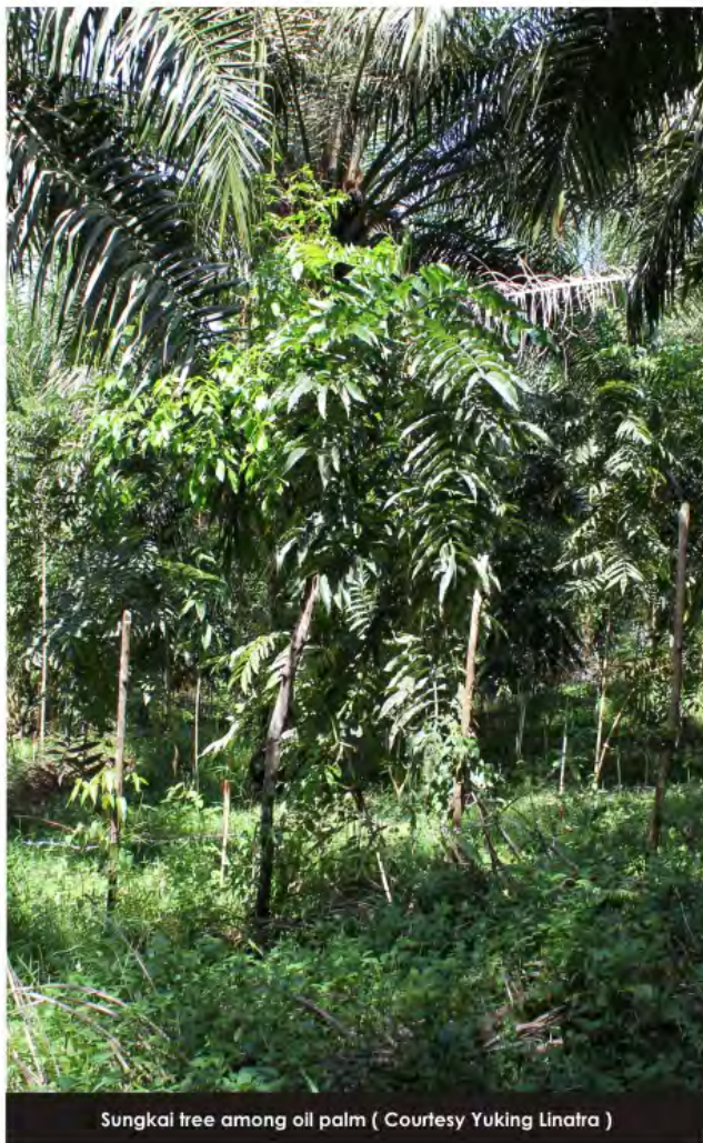
Sungkai tree among oil palm