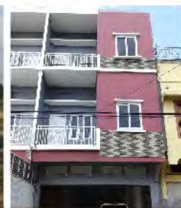
Jelutung house 2