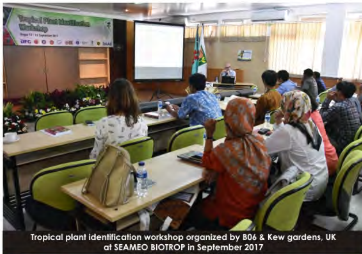
Tropical plant identification workshop organized by B06 & Kew gardens, UK at SEAMEO BIOTROP in September 2017