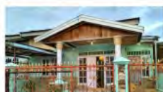
Field house in Muara Bulian