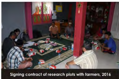
Signing contract of research plots with farmers, 2016