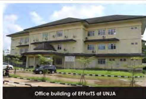
Office building of EFForTS at UNJA