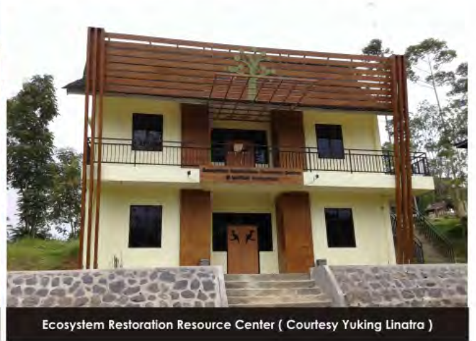
Ecosystem Restoration Resource Center