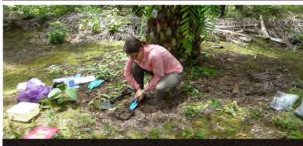
Collecting sample