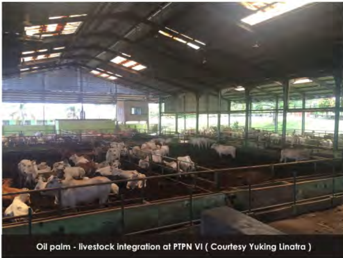
Oil palm - livestock integration at PTPN VI