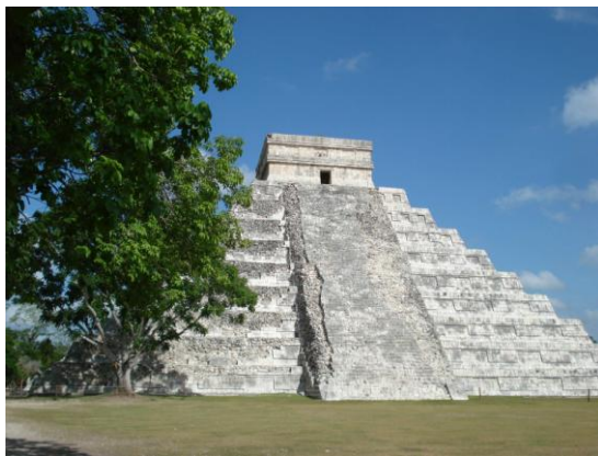
Pyramid of the “Kukulcán”

10.00-13.00 Guided sightseeing of the ruins