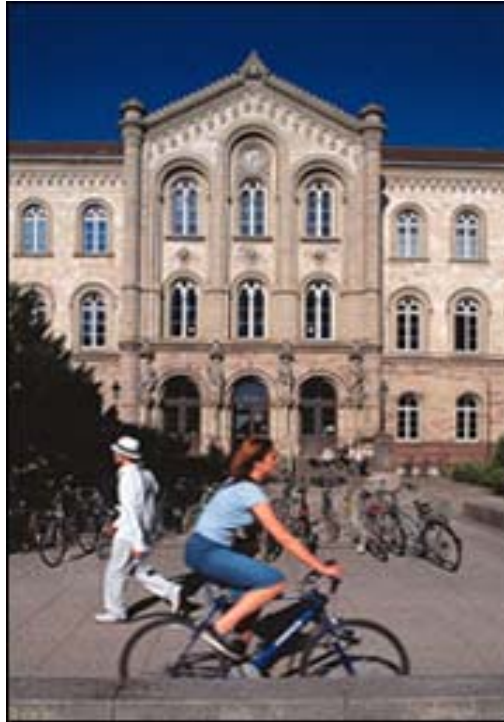
Georg-August-Universität Göttingen Germany