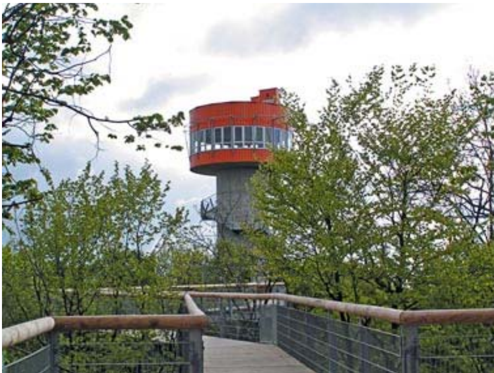
Tree Crown Path, Hainich National Park