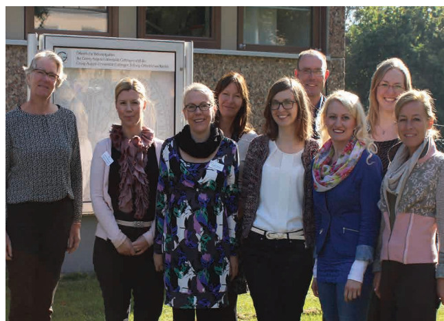
Participants of the U4 Staff Training Week "Welcome Centre". Göttingen, 10/2013

The application deadline for the exchange in 2014 ends on the 15th of November 15 2013. Further information about the project as well as the application form can be found at www.u4network.eu .