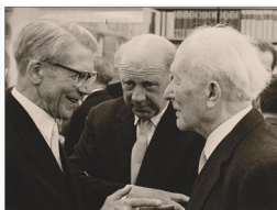
Hund's 70th birthday (1966): Friedrich Hund, Werner Heisenberg, and Max Born