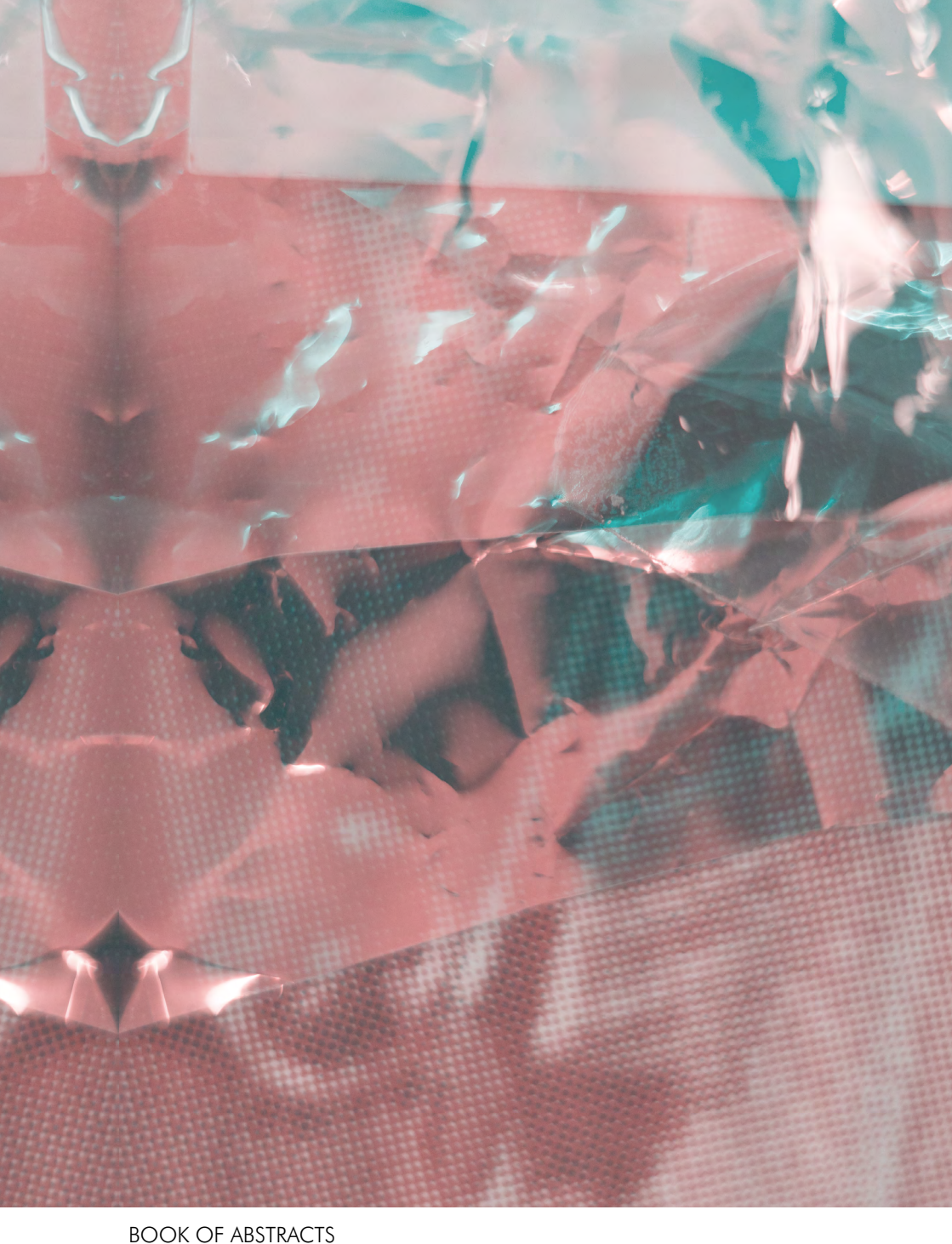
10th European Feminist Research Conference Difference, Diversity, Diffraction: Confronting Hegemonies and Dispossessions