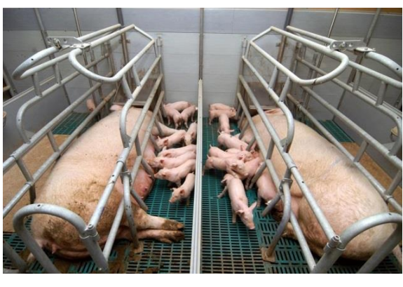
Figure 2. Pictures similar to original webcam pictures. a. Snapshot showing pig fattening pen. b. Snapshot showing farrowing pen with sows and piglets.