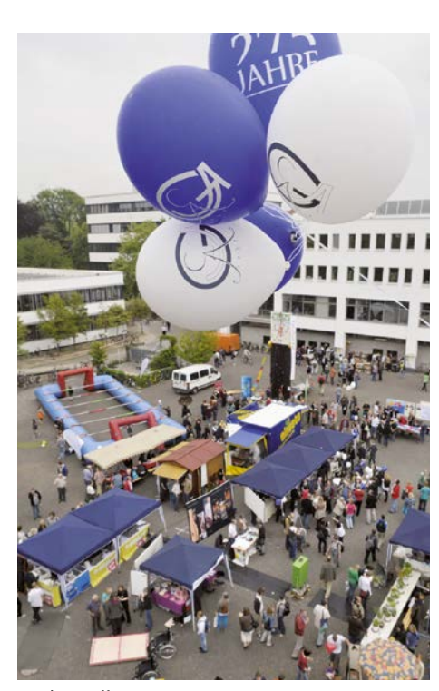
At the staff party

for the ongoing performance of research and teaching operations. In the future, academic personal development and transparency with respect to career paths will continue to be a priority within the University. Moreover, the University will offer continuing education regarding careers for graduates outside academia.