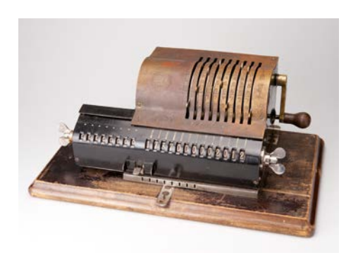
The Brunsviga calculating machine from the Collection of Mathematical Models and Instruments

Also in the long-term, Göttingen University will continue to be funded primarily from the public purse. An important element here is the 'Hochschulentwicklungsvertrag'(Agreement on the Development of Higher Education Institutions). For innovations and initial project financing, the Presidential Board makes resources available from a special fund earmarked for such Resources purposes. becoming available from this fund will be utilised more intensively for measures to raise the profile of the University as a whole. Where such plans involve any reallocation of resources across entities or Faculties, transparent criteria and procedures for reaching reallocation decisions will be developed together with the Faculties and boards.