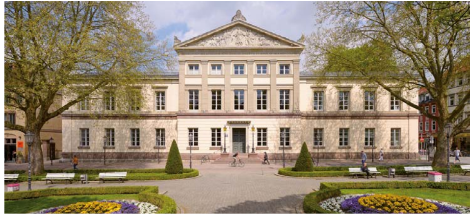
University Aula (Great Hall) Building

sity Medical Center (UMG), 12,000 employees. This includes 4,200 academic staff, 480 of whom are professors. As a Public Law Foundation, the University and the University Medical Center Göttingen have an annual turnover amounting to 1 billion euros. Financial support is provided through the Land of Lower Saxony, third-party funding from various funding agencies and institutions, and Medical Center revenues.