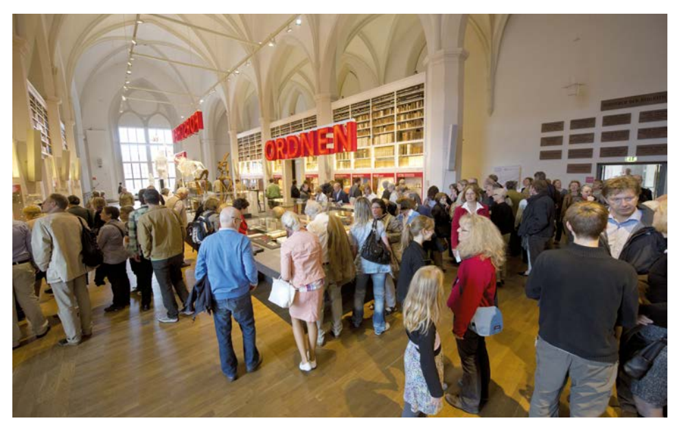
'Objects of Knowledge' exhibition in the Paulinerkirche

power to make judgements as a prime educational objective. In research, teaching and study, the University guarantees a sheltered environment for constructive criticism, a prerequisite in the search for truth in science. This process is dependent on mutual respect among all those involved, and on taking responsibility for the consequences that scientific work can have on human beings in their social and natural environment.