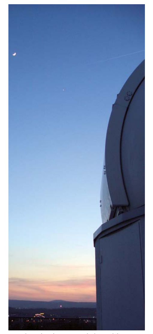
View from the observation platform of the Institute for Astrophysics, Göttingen

The University creates a research environment designed to give scholars and scientists the necessary space and freedom to achieve the best possible results in research within the disciplines and in interdisciplinary problem-solving. It fosters self-determinant studying and a culture of cross-disciplinary and research-oriented teaching across all University Faculties. By providing