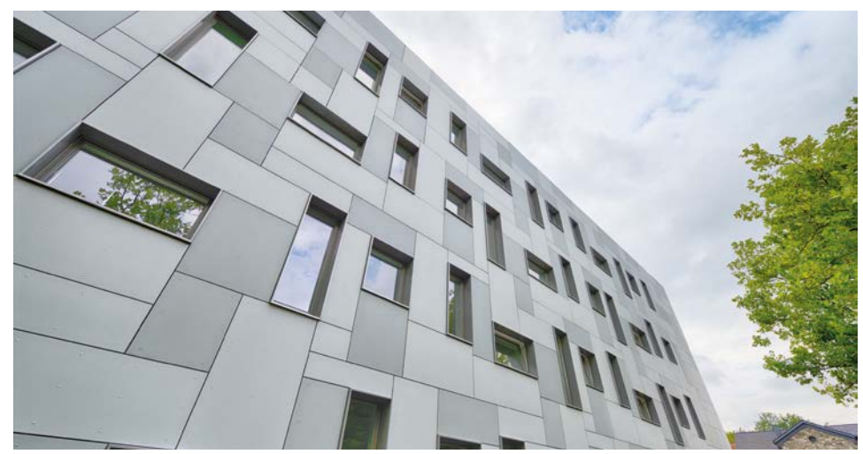
Learning and Study Building, opened in 2013

Göttingen University welcomes competition with other national and international academic and research institutions. Its long-term aim is to remain one of the finest German universities and to hold its place among the world's top one hundred in prominent international rankings.