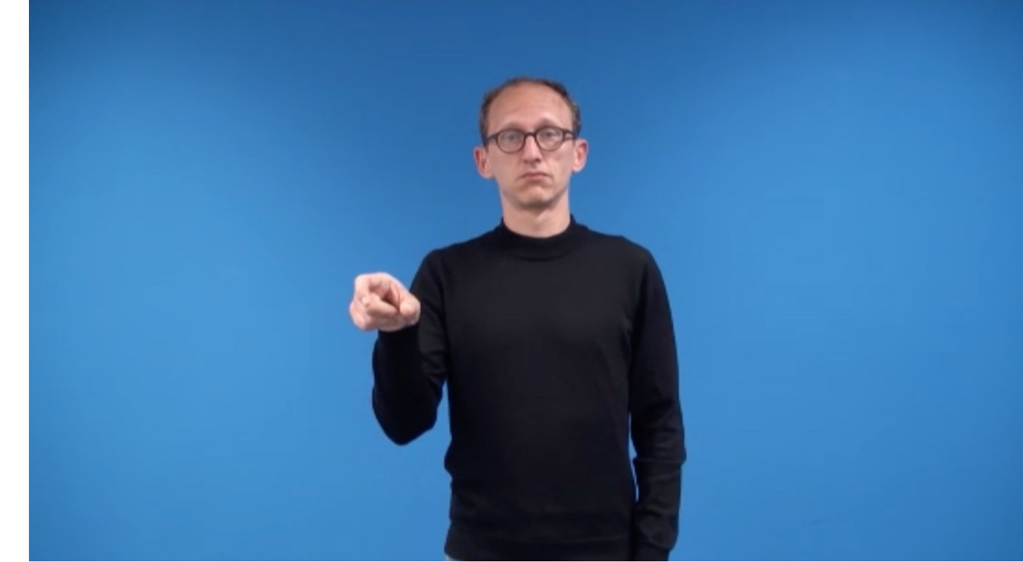
Figure 2: Two video stills showing the beginning (subject) and end (object) point of the path movement of the agreement auxiliary PAM (Person Agreement Marker) in DGS thereby expressing spatial agreement with two arguments (subject and object) of the main verb