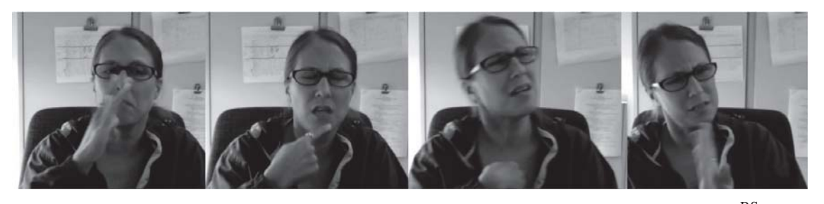
Figure 1: MOM SAY 'Mom<sub>k</sub> says I_k am busy'

'Mom<sub>k</sub> imagines I<sub>k</sub> am busy'