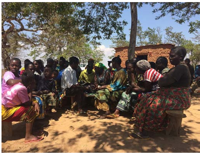
A community savings/credit group meets under at a church in Kongwa District, Dodoma Region, Tanzania

The regional focus of many savings promotion interventions is Sub-Saharan Africa, where we observe the second lowest penetration of formal bank accounts worldwide only surpassed by the Middle East. Although many individuals in Sub-Saharan Africa still live below the poverty line, there is empirical evidence that even the poor are able to save. About 60 percent of the population reports to have set aside some money during the last 12 months. Yet, about 60 percent of men and even about 70 percent of women in Sub-Saharan Africa do not hold a formal bank account.