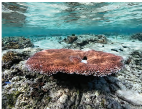
Acropora hyacinthus coral colony in the Ofu, American Samoa back reef.