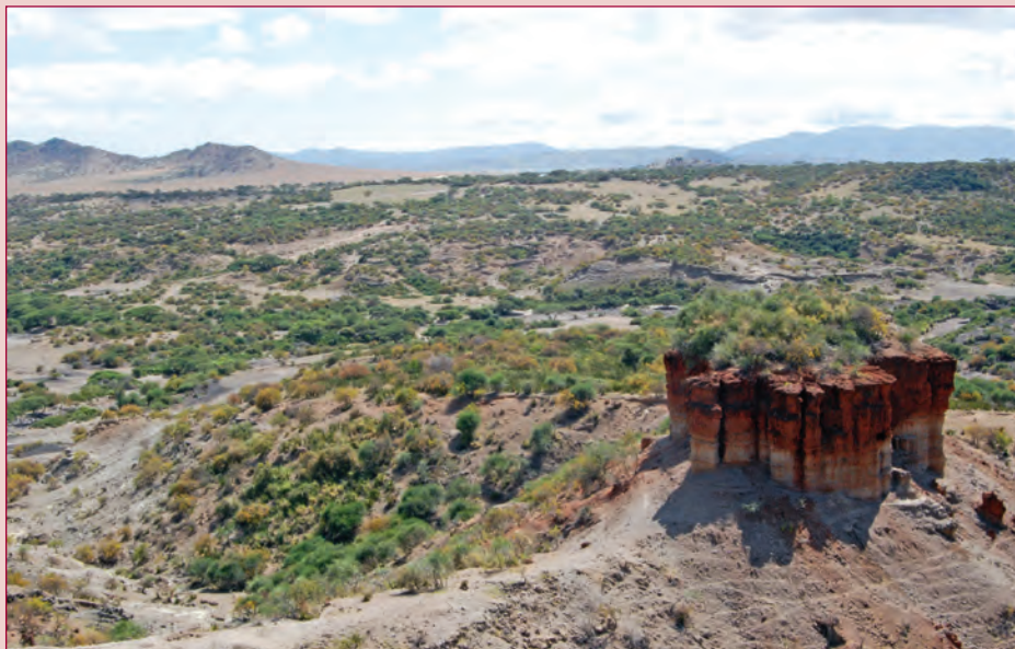
Olduvai Gorge, Africa.

Past climate provides a context for understanding the course of early human evolution. But terrestrial proxy records are typically too degraded or incomplete to reveal local ecosystem characteristics and rapid environmental changes. In a pair of papers, Clayton Magill et al. (pp. 1167–1174 and pp. 1175–1180) report a lipid biomarker and isotopic signatures for organic matter preserved in lake sediments at Olduvai Gorge, Africa, dating to a key interval around 2 million years ago when Homo erectus ( sensu lato ) emerged and began to disperse across Africa. Us-