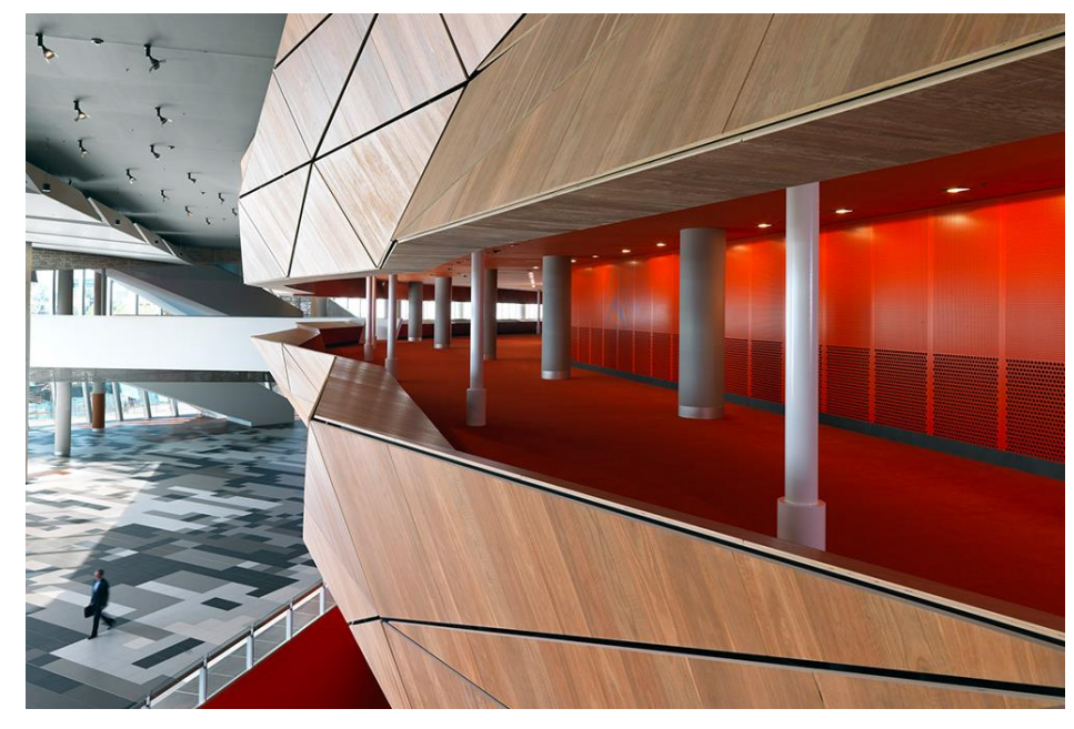
XX ISA World Congress of Sociology June 25-July 1, 2023, Melbourne, Australia