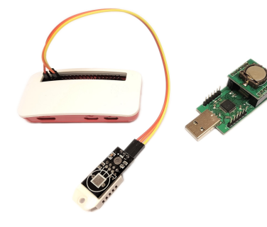
Figure 2: Mock-ups used: RasPi Zero with a DHT-22 sensor (left), custom board (right).