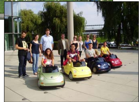
IP Workshop 31.10.2012 Dublin