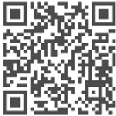
Please scan for further information!