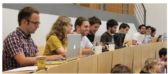
For further information and application, please refer to <u>hasco.uni-goettingen.de</u>.

The European Hadron Collider Physics summer school, HASCO, will take place for the second time in Göttingen from 07-19 July 2013. Expected are 60 students and 20 lecturers from 20 European universities and the European Center for Nuclear Research CERN in Geneva. Lectures, seminars and tutorials will present the basics as well as special topics in hadron collider physics, in particular the physics of the Large Hadron Collider (LHC). After the discovery of a new, Higgs-like particle in July 2012 in the LHC experiments, the physics of the Higgs-boson will be a special focus of the school this year.