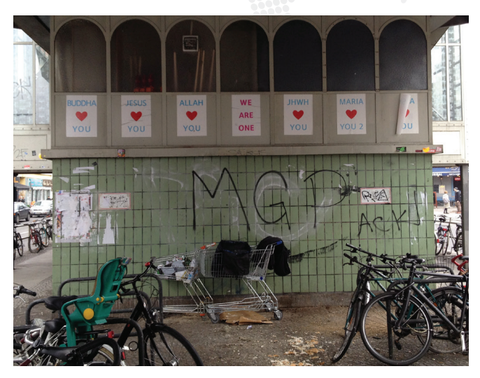
More information at: <u>www.uni-goettingen.de/en/426457</u>. html

Urban spaces have always functioned as cradles and laboratories for religious movements and spiritualities. The conference "Religion in Urban Spaces" will take place from the 9th to the 11th of April 2014 in Göttingen and will aim to explore the intense and complex interplay between the (post)modern city and religion, bringing the city to the foreground in religious research. Both renowned and young scholars from all over the world will present their latest research and bring into discussion the ways the experience of the urban - the cityscape with its pluralist culture - inscribes itself in religious practices, and vice versa: how religions appropriate and transform (the meanings of) the urban. The conference is organised by the Institute for Cultural Anthropology/European Ethnology at the University of Göttingen in cooperation with the Institute of European Ethnology at the University of Amsterdam and the Royal Netherlands Academy of Arts and Sciences.