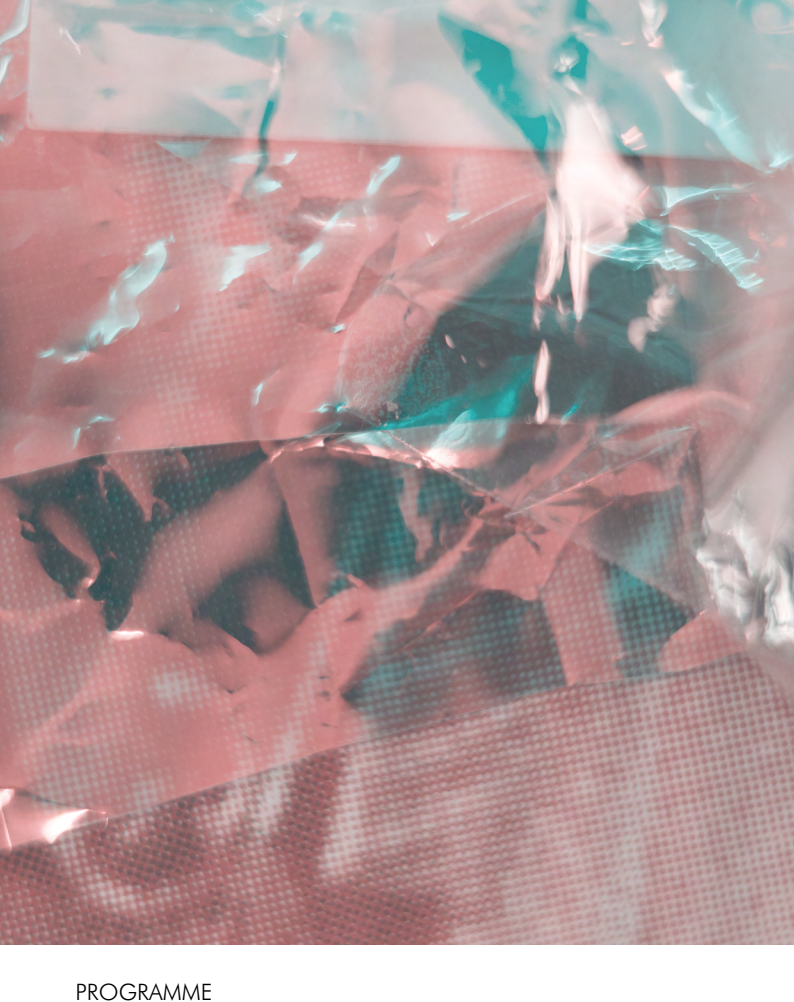
10th European Feminist Research Conference. Difference, Diversity, Diffraction: Confronting Hegemonies and Dispossessions