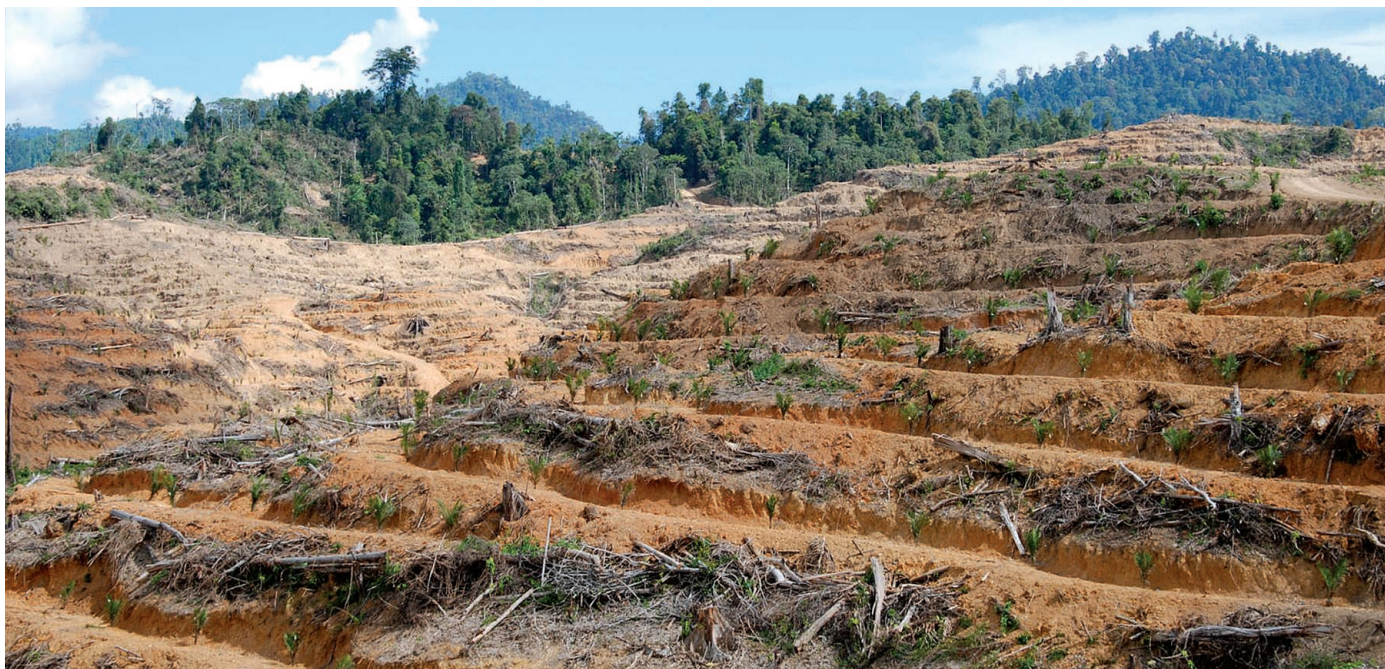
The unstoppable oil palm? Oil palm is a tropical crop that presents the highest yield per hectare of oil-producing crops in the world. New high-yielding varieties could spare land for forests worldwide or could increase tropical deforestation as oil production is transferred to the tropics. The image shows land cleared for oil palm plantation in Malaysian Borneo.